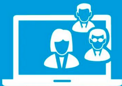
HR4YOU - HCM