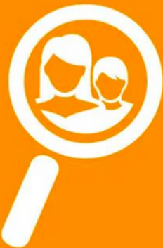
HR4YOU - eSearcher