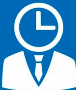
HR4YOU - eTemp