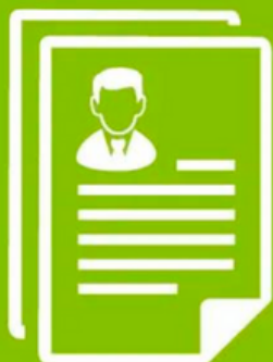
HR4YOU - TRM